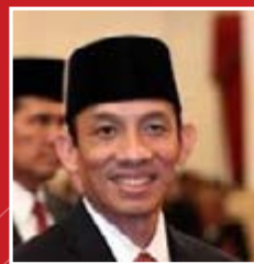
Dr. Arcandra Tahar Vice Minister of Energy & Mineral Resources Indonesia