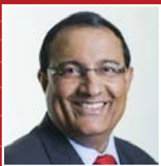
S. Iswaran Minister for Trade & Industry Singapore