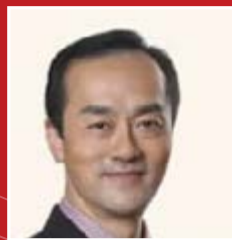
Dr. Goh Poh Koon Minister of Trade and Industry Singapore